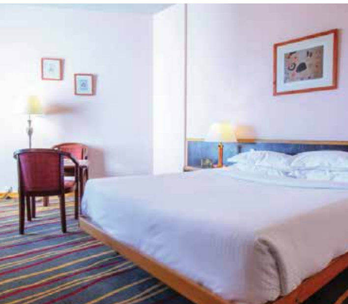
Chart your own path and choose from one of four comfortable and classic configurations spanning across 136 rooms. Each room is equipped with attached bathrooms, natural light, free WIFI, satellite TV, air conditioning, and several other amenities.