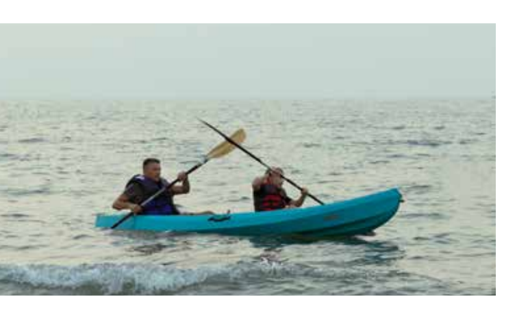
Chart your path to new adventures every hour with our all-inclusive activities. Whether you're here with kids, on a romantic getaway, for a solo stay cay, or with friends — there's something for everyone.